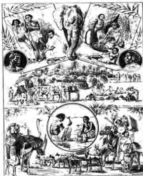
Scenes among the Samitis.