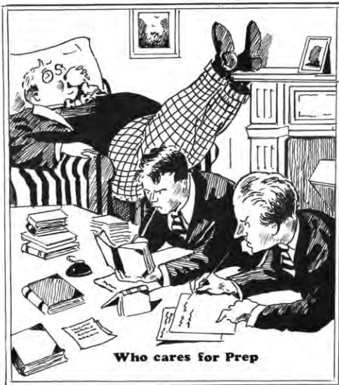
Who cares for Prep