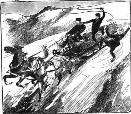
Wiley rushed at Tom. The boy seized the whip lying at the bottom of the sleigh, and made one desperate slash at the miserable wretch. He put all his energy into that slash. Wiley gave a yell to one piercing, swollen yell, then he toppled headlong from the sleigh. (See my splendid new serial, "Strong-hand Sam," on page 427.)

(COPYRIGHT. This non-profit making magazine is privately circulated. The reproduction of the contents, either wholly or in part, without written permission from The Editor, is strictly forbidden.)