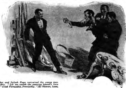
Tinker and Splash Page restrained the young man forcibly. "Let me smash the sneaking hound's face in!" cried Fernandes frenziedly. "By Heaven, Lann, I'll kill you for this!"