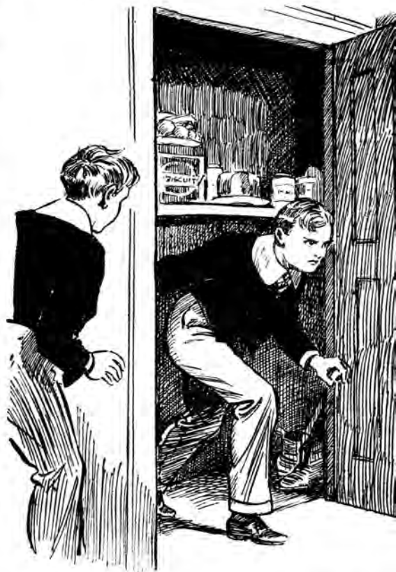
Mr. Railton and Mr. Linton both gave a start of surprise when they saw that the beak was gone.

Lowther. Whether Mr. Railton had, or had not, gone out was a matter of complete indifference to them. Apparently it was not to Monty Lowther.