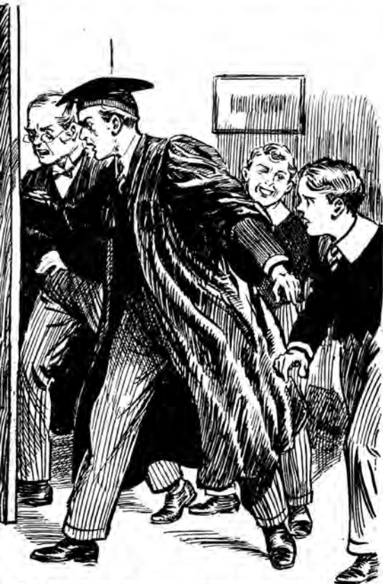
a New House junior emerged from the cupboard. It begins!

"I shouldn't wonder. What the dickens are you burbling about?" asked Tom, puzzled.