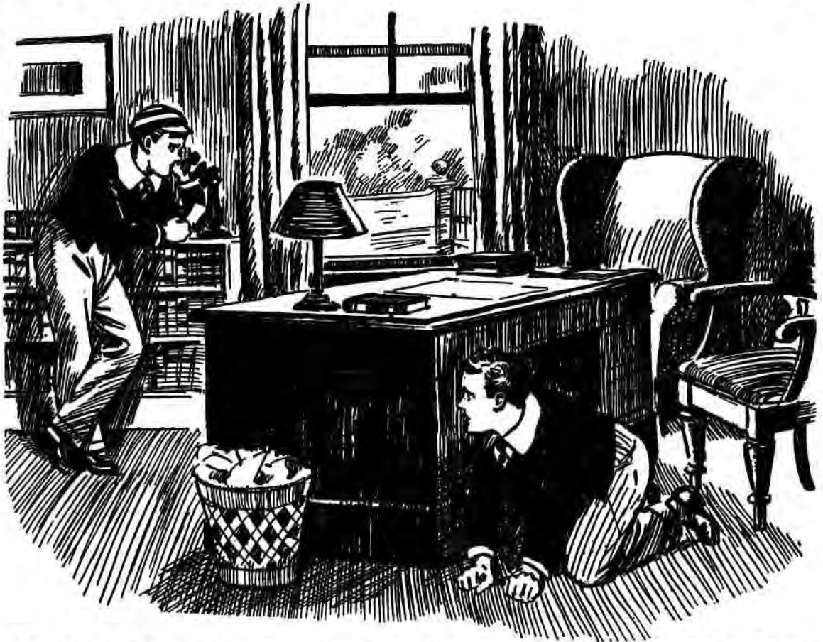
"Speaking from St. Jim's," said Grundy. "I want a dozen guinea bats. Send the bill with them, and tell the man to wait to be paid. Take down the name for delivery—G. Figgins, New House." Kerr, behind Mr. Ralton's desk, suppressed a gasp of astonishment.

New House junior had ducked out of sight on the farther side of the same