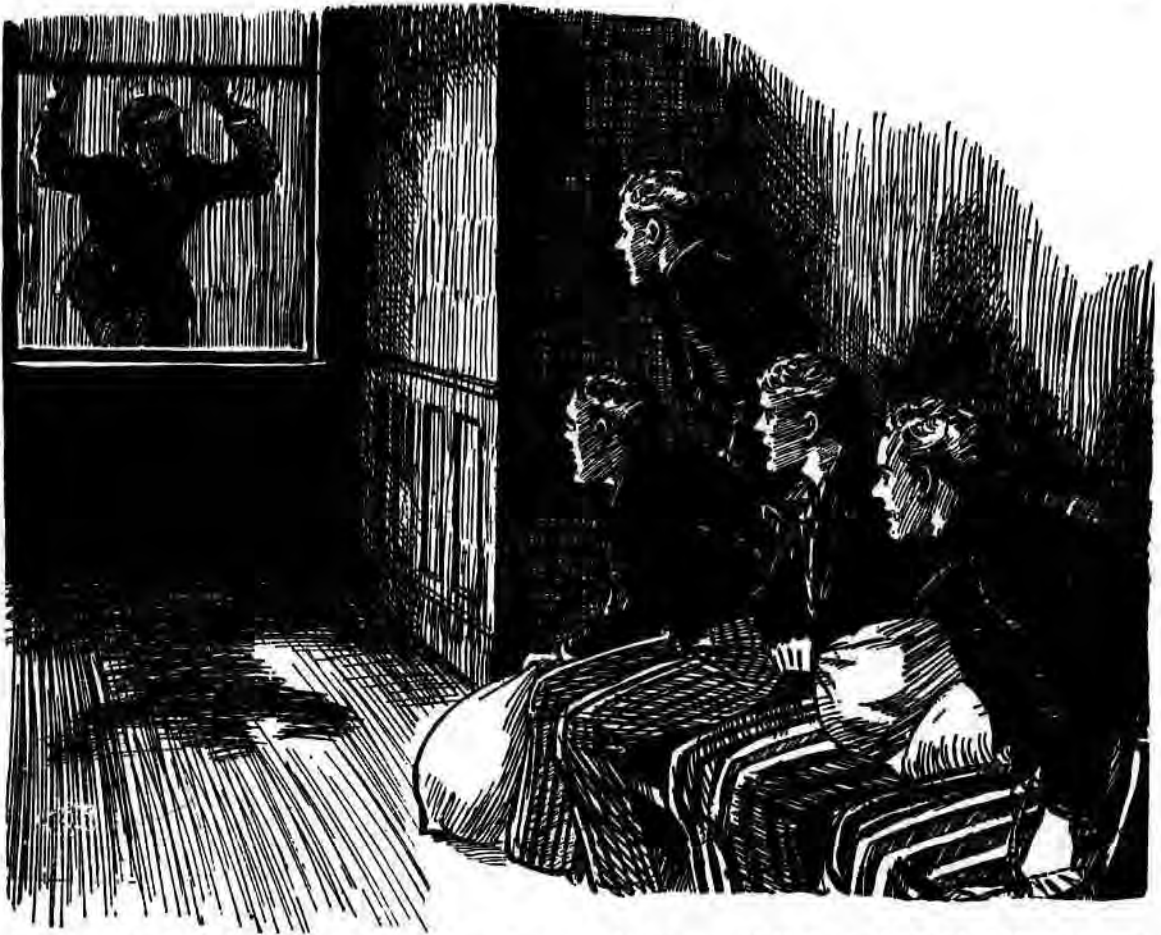
"Bai Jove! Look!" gasped Arthur Augustus, as a dark figure blotted the starlight at the window. "Quiet!" hissed Blake. The New House raiders were coming, and the four Fourth Formers waited for them tensely.

"Nothing so far," said Tom Merry. "Not even chucked a tomato at the French master."