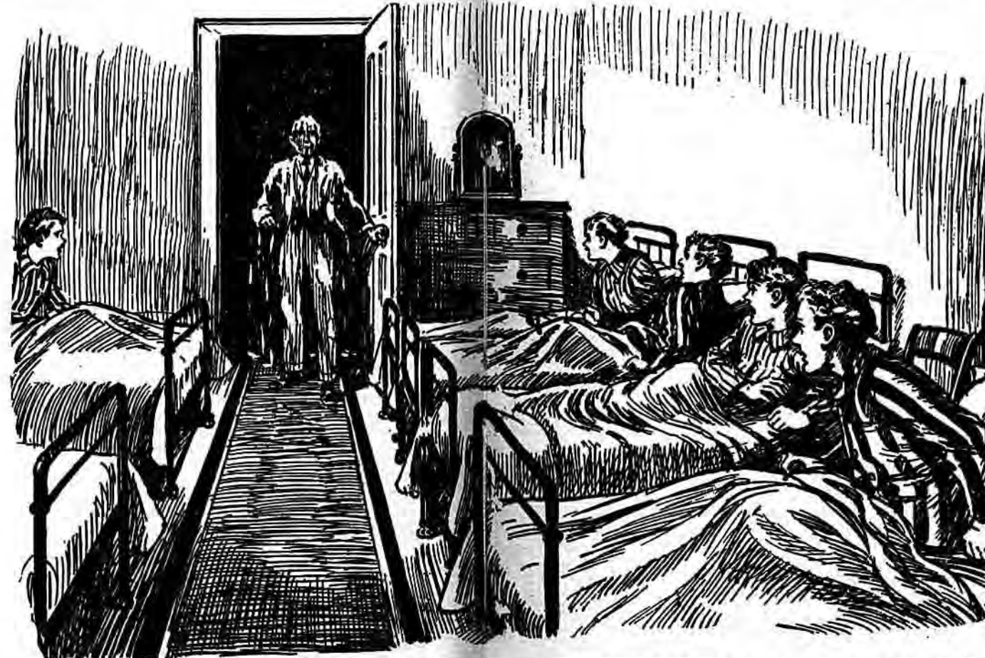
All eyes in the Shell dormitory were fixed on the figure in the doorway. It was Kildare—but he was hardly recognisable as the captain of St. Jim's. Green pawmothered his head, his face, and his clothes!

"Don't cackle!" roared Grundy. "If you can see anything to cackle at in this, I can't! Will you lend me some tin, blow you?"