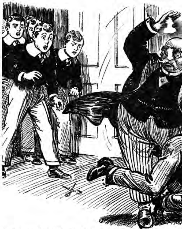
"Dis is one drick!" panted Herr Schneider, thumping Glyn. "Ach! I preake efery pone—" "Yaroooh! Help! Rescue!" Tom Merry looked into the study in alarm.

Bernard Glyn laid a little bag, which he had brought in the cab, upon a chair, and opened it. Herr Schneider sat down in his armchair with another grunt.