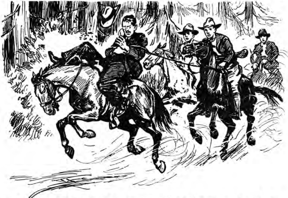
Mr. Trevelyan made a furious clutch at the rope as the noose settled round him. But as he did so Beauclerc dragged on the rope. The noose whipped tight, and the drag on the rope jerked the horseman from the saddle.

frown of deep thought on Vere Beauclerc's face. "That man is an impostor, and he has had my father kidnapped," he said quietly. "He did not think that I should know or suspect anything. He has carried it off well, but he must be alarmed and scared at having the sheriff brought into the matter."