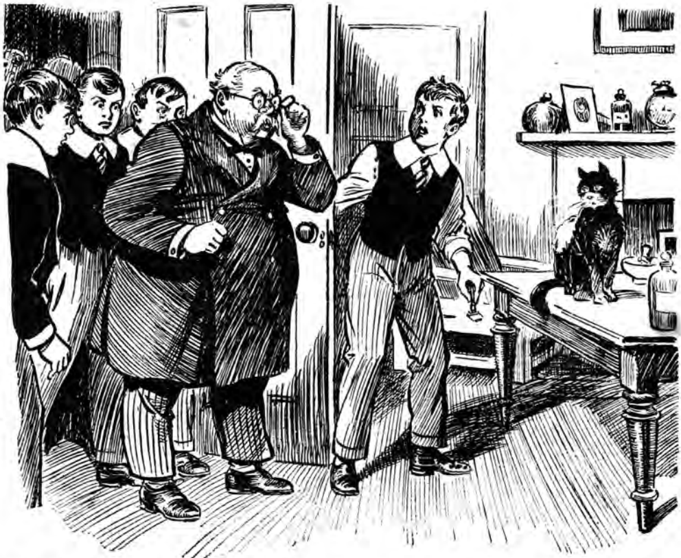
As Herr Schneider strode into the study, the juniors crowded round the doorway, looking in. Glyn had a safety-razor in his hand, and on the table was the cat, with a lather of soap on him. Astounding as it seemed, there was no doubt that Glyn had been attempting to shave Mrs. Mimms' cat!

"But if any of you chaps would care for a