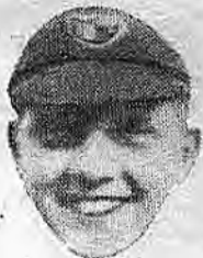
"Anonymous," of London, tests Blake with some leasers.

during the Terror, executed 1794, was called by Carlyle "The Sea Green Incorruptible."