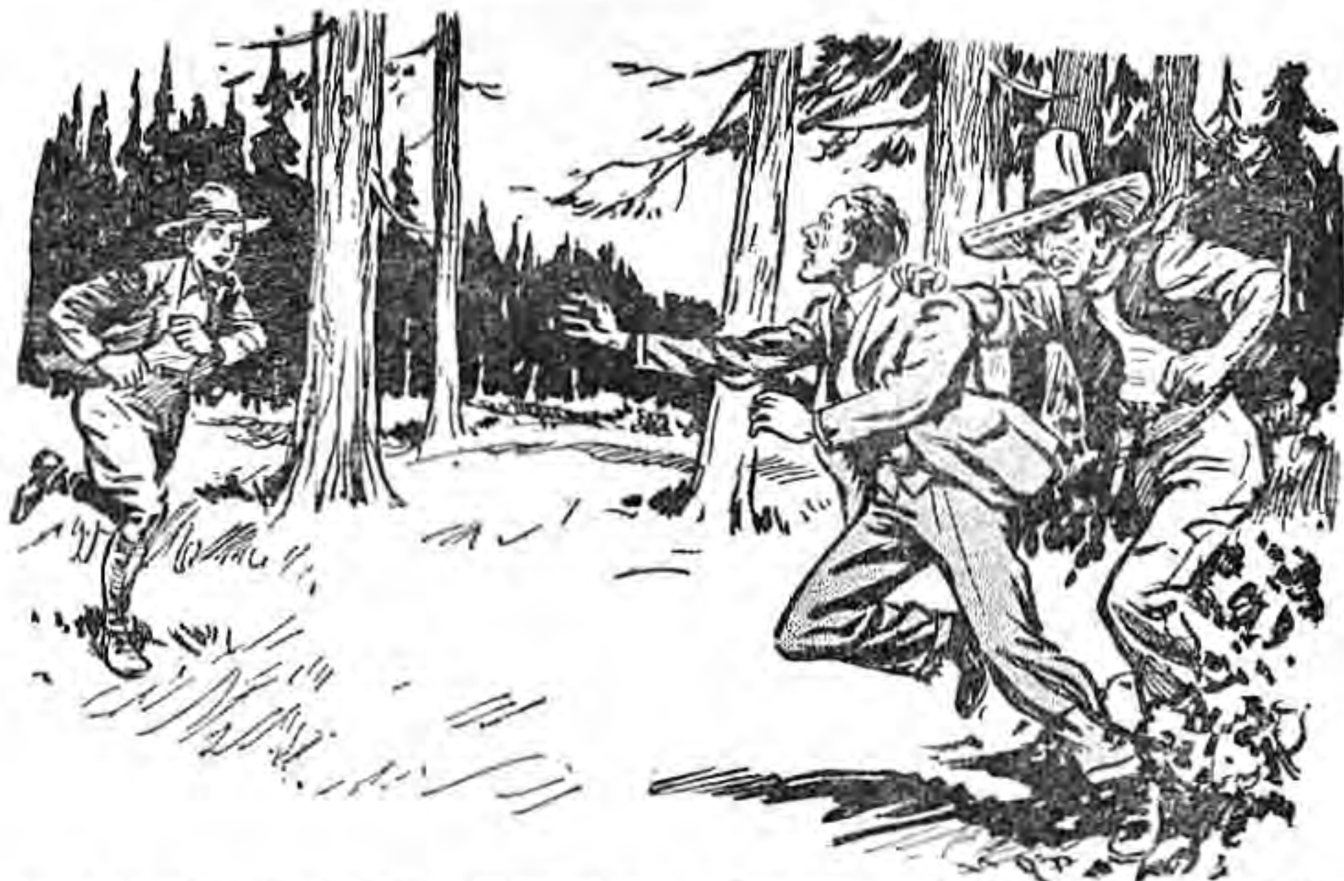
"Help!" panted the stranger as he caught sight of Beauclerc. "They're after me!" The lithe form of 'Frisco Jo came rushing after the fugitive, and his dusky hand gripped the panting man.

The remittance man was still at work in the fields in the fading light, and the three chums sat down to supper together in the shack.