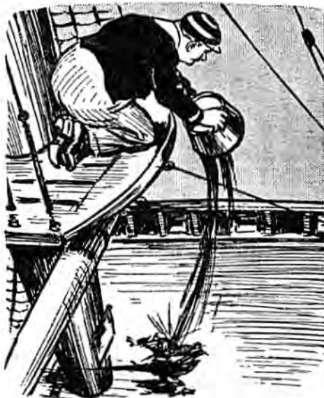
Tuckey upended the pail and the ink and water shot down upon the figure below. Swoosh! "Grooooch!" came a choked exclamation from the unfortunate victim.