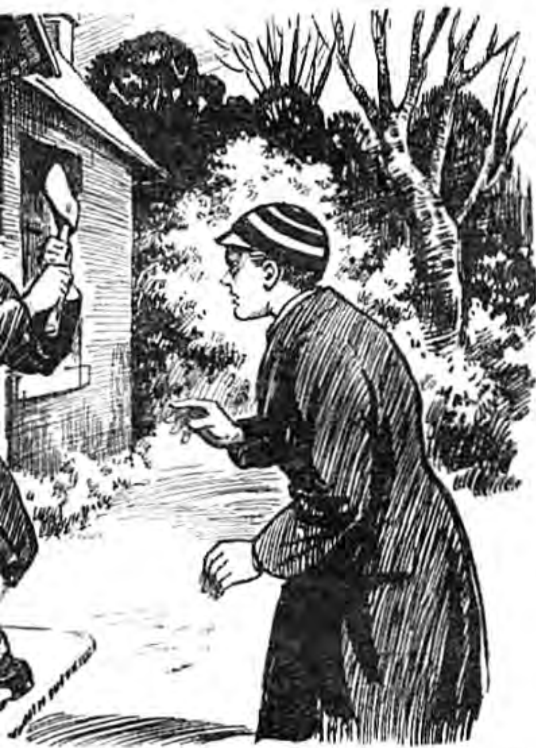
"There's plenty of law in this country, if they want it!" The axe of the South African wielded it upon the door.

"Your mistake. It let. You don't know how