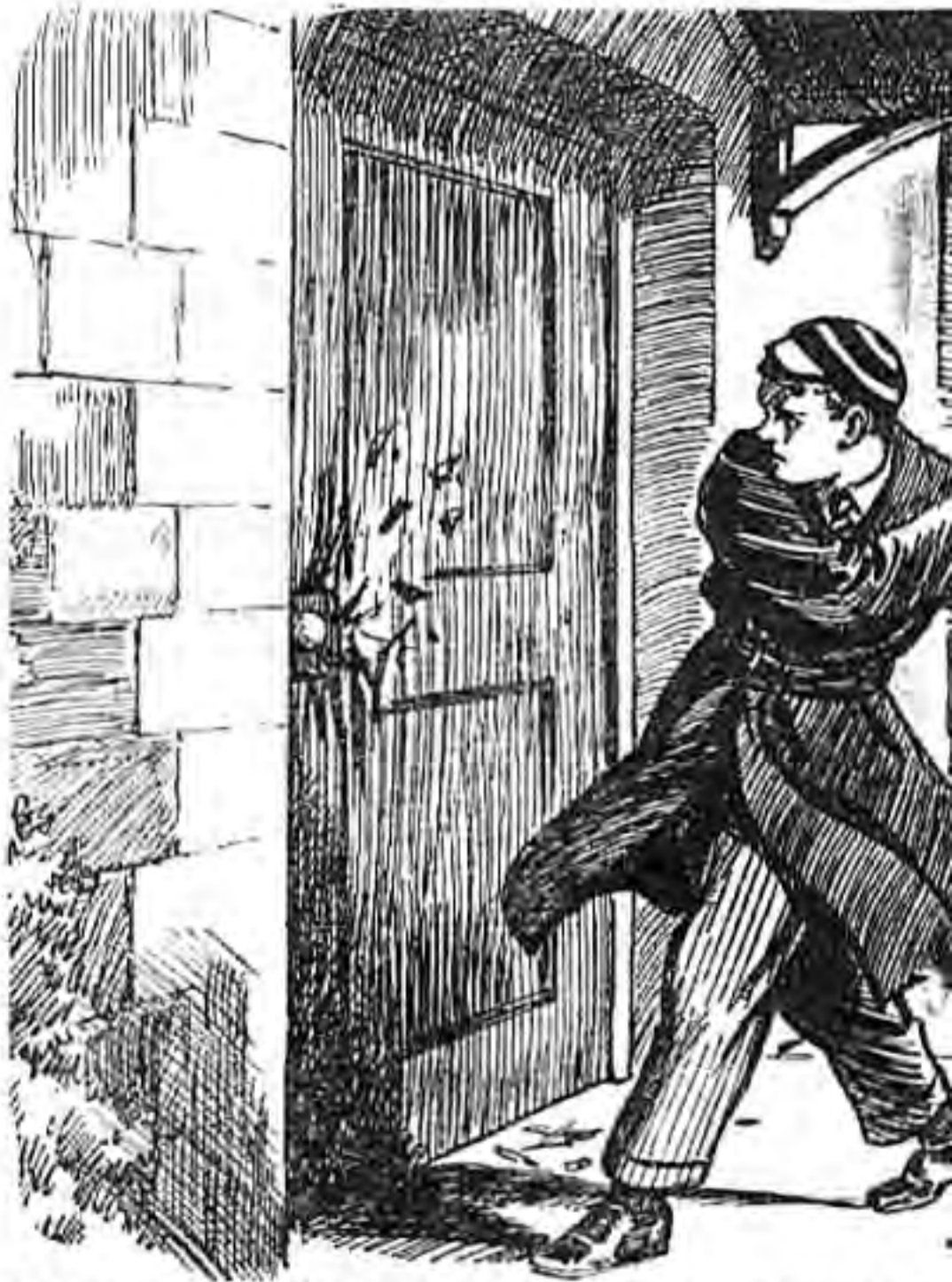
"They can call in the police if they like!" said Clive coolly. Crash, crash! The next moment splinters flew under the edge