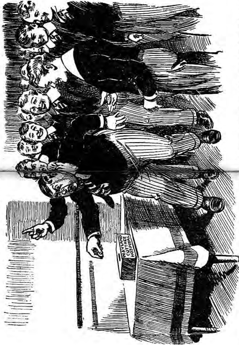
"Look here, Grundy—" began Baggie Trimble. "You've got five seconds to put the half-a-crown in the box," said George Alfred, "or I'll bang your napper on it!" With an expression of a victim suffering under a hard-hearted dentist, Baggie dropped the half-crown in the box.

The fags marched on to Study No. 6, and the