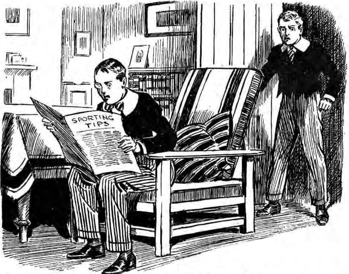
"Fifteen to one against Jolly Wogah," said the swell of St. Jim's. "Bai Jove! If a fellow had ten pounds on Jolly Wogah he would bag a hundred and fifty pounds!" Jack Blake stared in astonishment as he entered Study No. 6.

Baggy, having noted the general interest taken in the subject, had plainly seen a chance to do a little profiteering himself—or thought so, at all events.