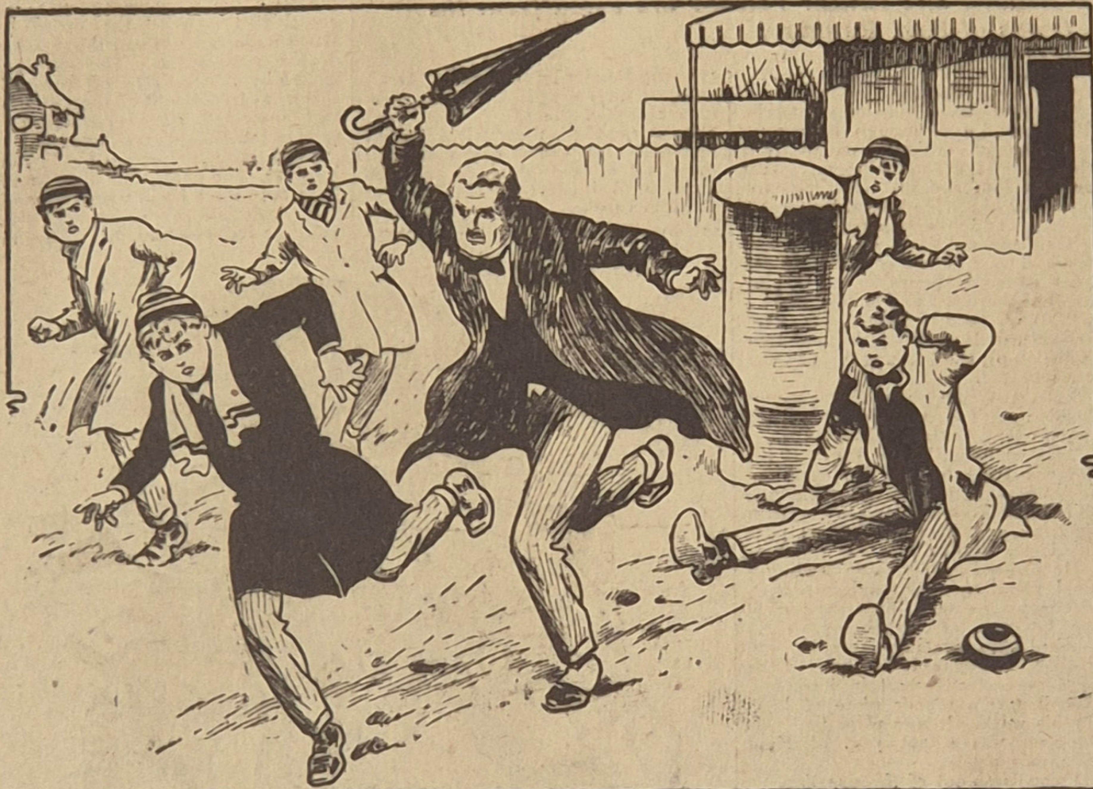
TROUBLE FOR THE SNOWBALLERS! The stern old gentleman made a sudden rush at the Rookwooders who had been snowballing him, and his umbrella smote right and left. "Oh, my hat!" gasped Lovell, as he sat in the snow. "Yaroor! Help!" Like straws before the wind the Fistical Four and Putty Grace were scattered by the charge.

(Next week's scintillatingly funny story of Rookwood School is entitled "Bucking Up, Cuffy!" On no account must you miss it! Order your copy of the BOYS' FRIEND in advance and avoid disappointment!)