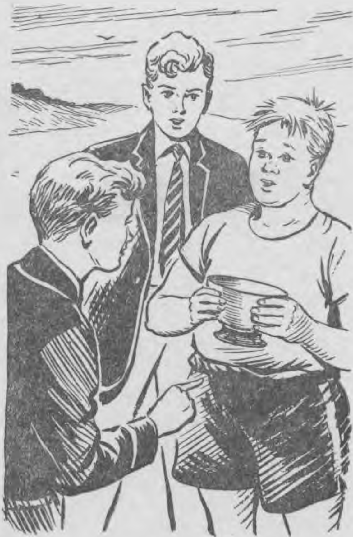
Skip disinterred the article from inside his shirt.

"Oh, come on," said Tom. "We've none too much time now, and you look as if you want a wash before you show up in hall. Get a move on."