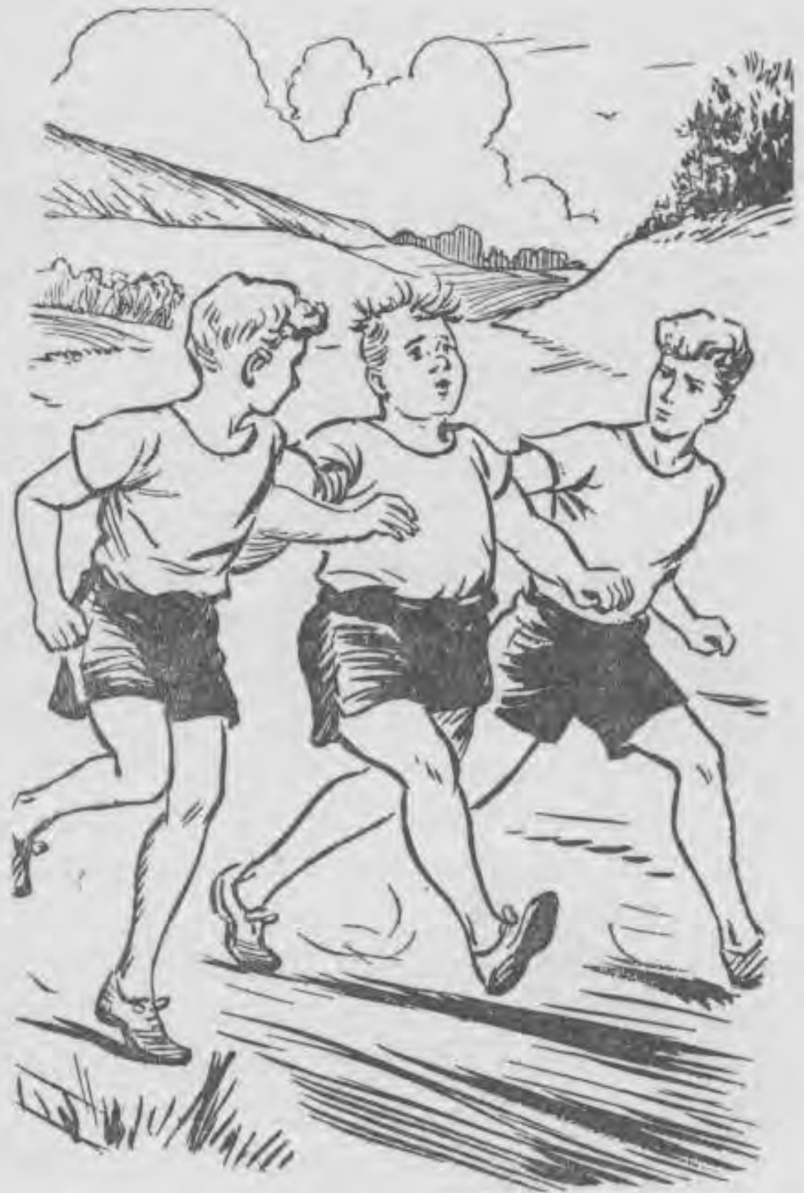
His chums slowed down and kindly lent him first-aid.

What became of Skip afterwards, they did not know. Neither did Skip know what became of them. They vanished from Skip's vision, and the tail of the pack vanished soon after,