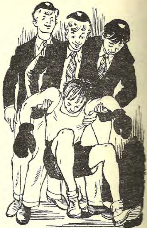
Two or three fellows helped Bullinger up

After the cricket, Tom King and Dick Warren remembered the existence of their fat chum. They were rather worried and troubled about Skip. But after a talk with Bullinger, and what he told them, they went down to the gates to wait for Skip to come in, with cheerful faces. Skip rolled in at last, red and perspiring. Somewhat to his surprise, his chums raised no further objections to that fight with Bullinger. Skip would not have heeded them anyhow. But so far from raising objections, King and Warren entered heartily into the spirit of the thing. When Skip had had a rest - which he needed - they walked him round the corner behind the gym, where such affairs were usually settled by Felgate juniors who felt an irresistible urge to punch one another's noses. Bullinger was there, with Reece as his second, and a dozen Fourth form men