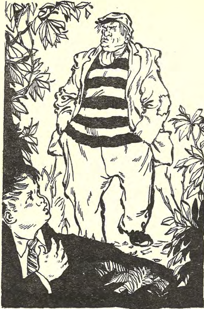
He was the most unpleasant tramp Skip had ever seen

And when the game started, they had to cease to wonder where Skip was, and what he might be up to: and in fact to forget his fat existence once more.