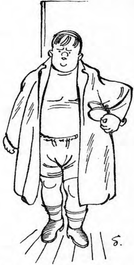
“You fellows coming?” asked Skip with dignity

Tom King nodded. He knew that. But he was going to act on that bright