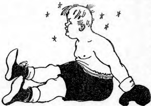
Skip sat and panted

Skip sat and panted. Charley, grinning, waited. The referee, in a gurgling voice, counted. Skip made frantic