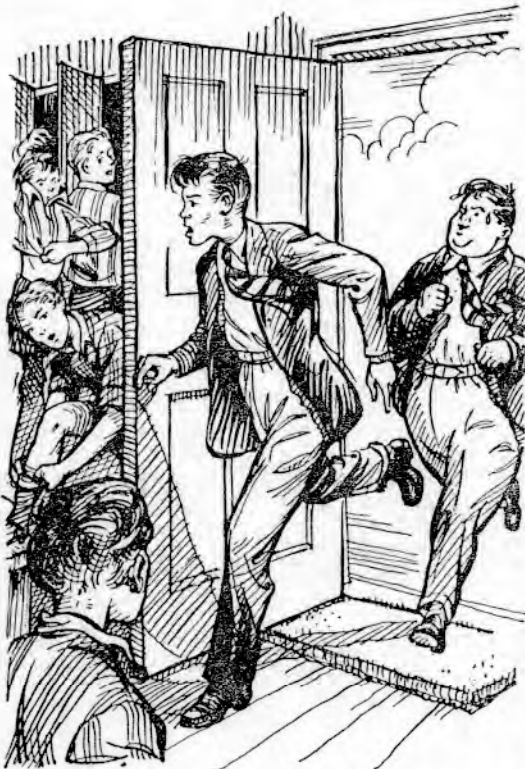
It was almost on time when Tom rushed into the changing-room, with Skip Ruggles puffing at his heels.

“Buck up, you fat frump!” roared Tom. “I’m going to boot you all the while you’re changing. You boot him, too, Dick.”