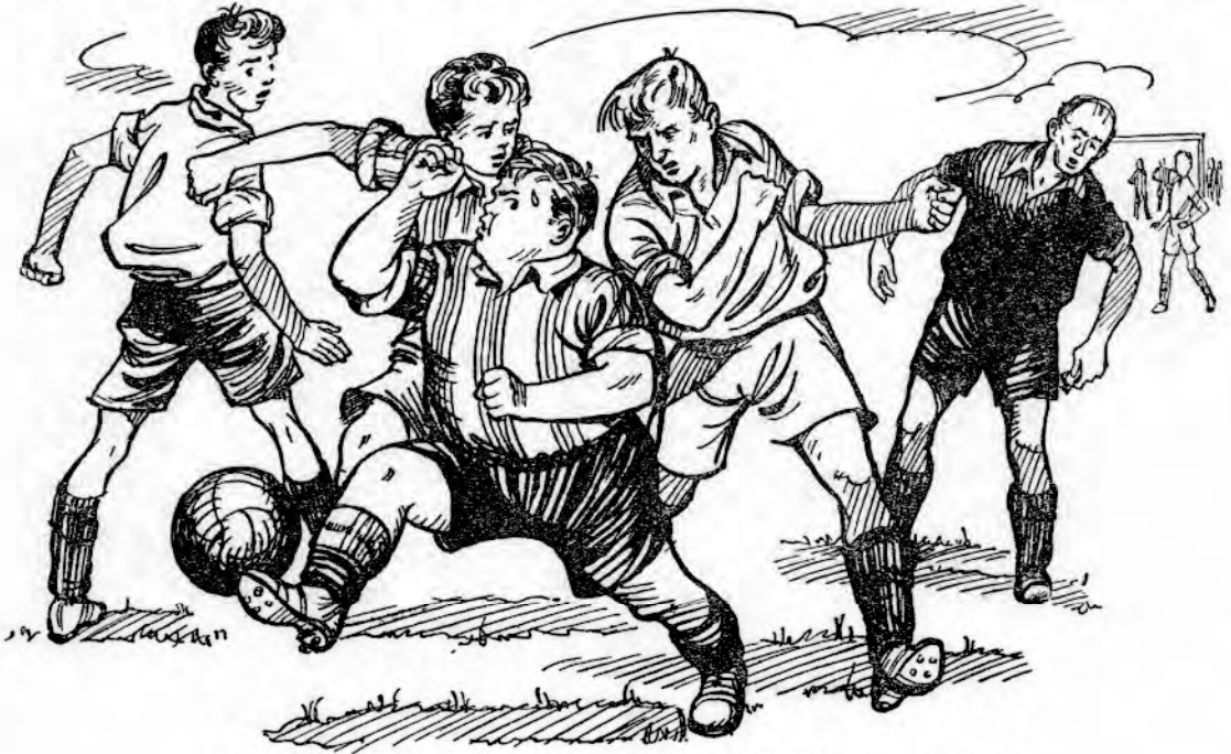
Probably it was only the presence of the Oakshott men that saved Skip from being massacred on the field

The game went on ding-dong. Dick Warren luckily proved equal to anything that Oakshott could do when they got through. As time drew near, it looked more and more as if Felgate might miraculously pull through that remarkable game at least undefeated. Almost on the finish, there was a mix-up in front of the Oakshott goal, into which Skip charged wildly, mad-