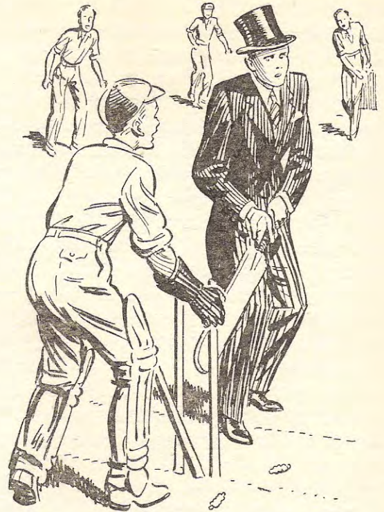
Denver fancied he was seeing visions.

But when Tom King was batting again it was not so hilarious. No fieldman raised his hat to Tom for the gift of the ball. Tom was the best junior bat at Felgate, and quite able to put up a good game, even against senior men—and especially when the senior men were incommoded by tails and toppers. He gave the seniors some leather-hunting, which in the circumstances, they found rather wearing, under a hot sun. Sixth Form faces were red, and perspiration