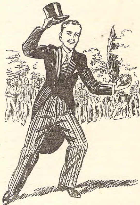
All Felgate yelled with merriment.

Tom King drew a deep, deep breath. He was tempted to wash out that match there and then, rather than be guyed in this manner. But he had a strong suspicion that that was just what the Sixth Form men would like. Langdale had kept his word: the Sixth were there to play the Fourth. But certainly they didn’t want to: and, if they did, they weren’t going to pretend to take the game with any seriousness. They were going to walk all over the cheeky fags in tails and toppers, amid laughter from all Felgate. But no doubt they would have preferred to wash the game out. Tom was not going to gratify them in that, at all events.