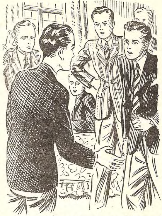
They could not believe that Langdale was serious.

Dick Warren sent the ball up into the air, straight as a die, and caught it with his left as it came down. Warren could do anything with the ball. He had a secret conviction that he was going to take Sixth Form wickets. Tom King, certainly, was going to score runs, even against bowlers like Denver and Loring. And they were all good men in the field—Tom always kept his men well up to the mark in that often neglected branch of the game. There were going to be some catches in the field that would surprise the Sixth—at least the heroes of