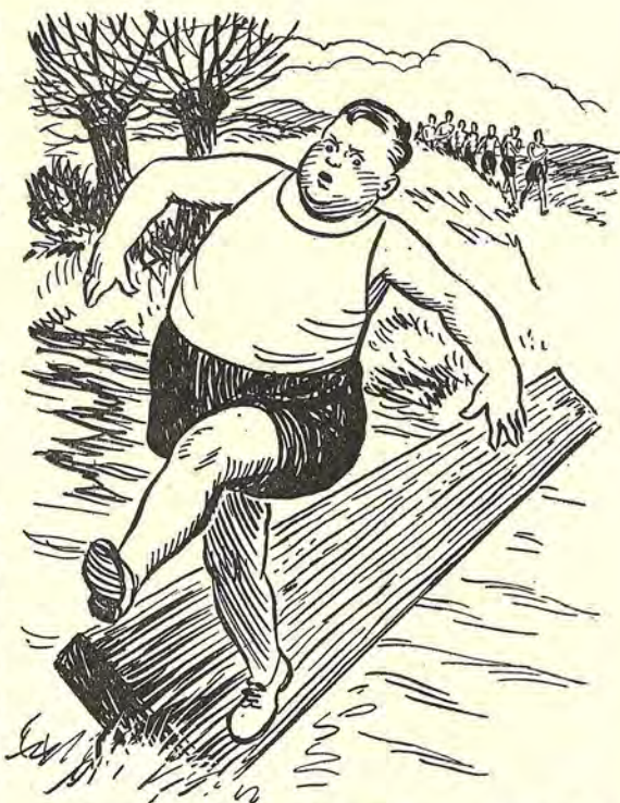
He reached the end of the plank . . . just as it tipped.

Naturally Skip had bellows to mend after a mile of it. But he glanced back, was encouraged, and plugged on, well ahead. But that burst of initial speed told on Skip by this time, and another glance back showed him that steady walkers were gaining. Selwyn of the Shell was in the lead, with Tom King