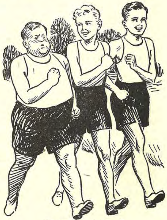
He kept up with his pals.

It was a strenuous day for Ruggles of the Fourth. In Study Four that evening he nodded over his prep. The bell for dorm was music to his fat ears. He fell into bed and did not reopen his eyes till the rising-bell rang. But he was prompt out of bed all the same, and the first man to seize a towel and rush for a shower. If Skip hated anything, it was a cold shower: but he rushed for it as if he loved it.