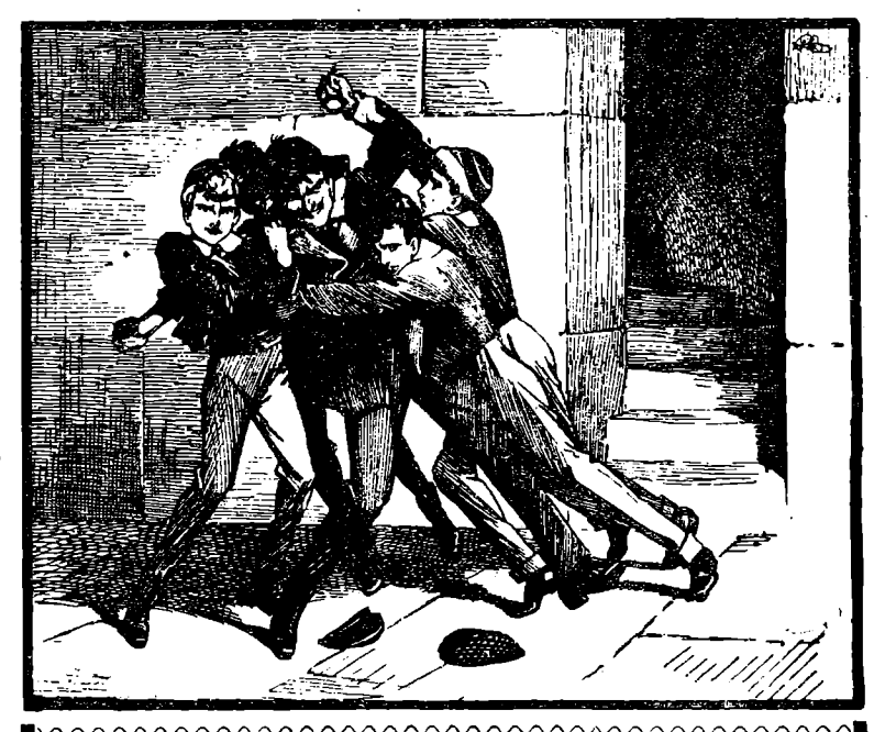
Like hounds clinging to a bear, the juniors rolled over and over, and they had the fellow down at last.

oath. The chums re-entered the passage. Wharton closed the stone door behind him, and they slowly retraced their steps towards Greyfriars. They had explored the subterranean passage, and had tound nothing of great interest in it, but certainly there had been a most curious adventure at the