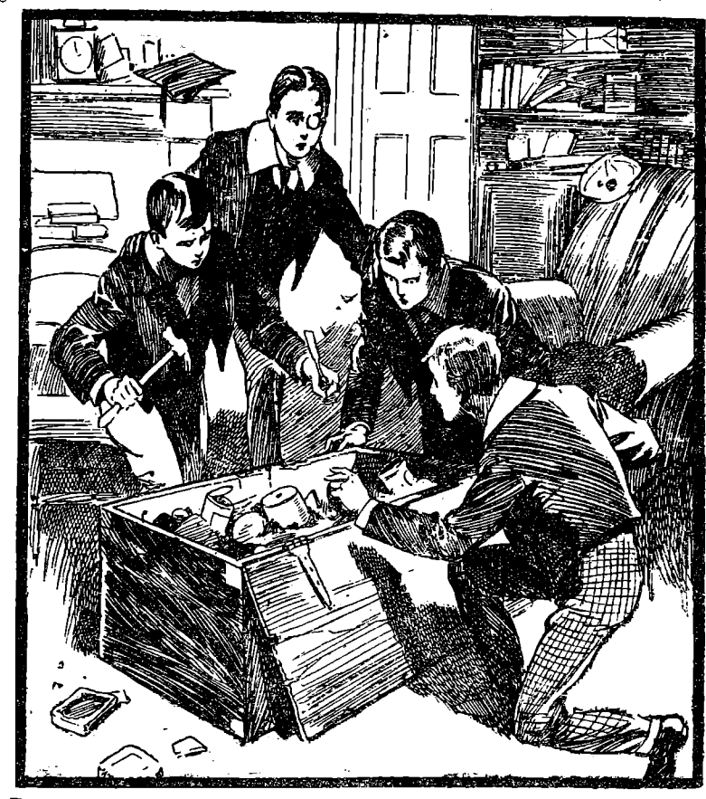
Topham and Townsend dropped on to their knees, and stared at the collection of rubbish which was revealed, and Smythe opened his eyes so widely that his monocle scarce held to its place.

Wrapped in a separate paper were a couple of pairs of new socks and a woollen scarf. Lower down was a box of chocolates, some