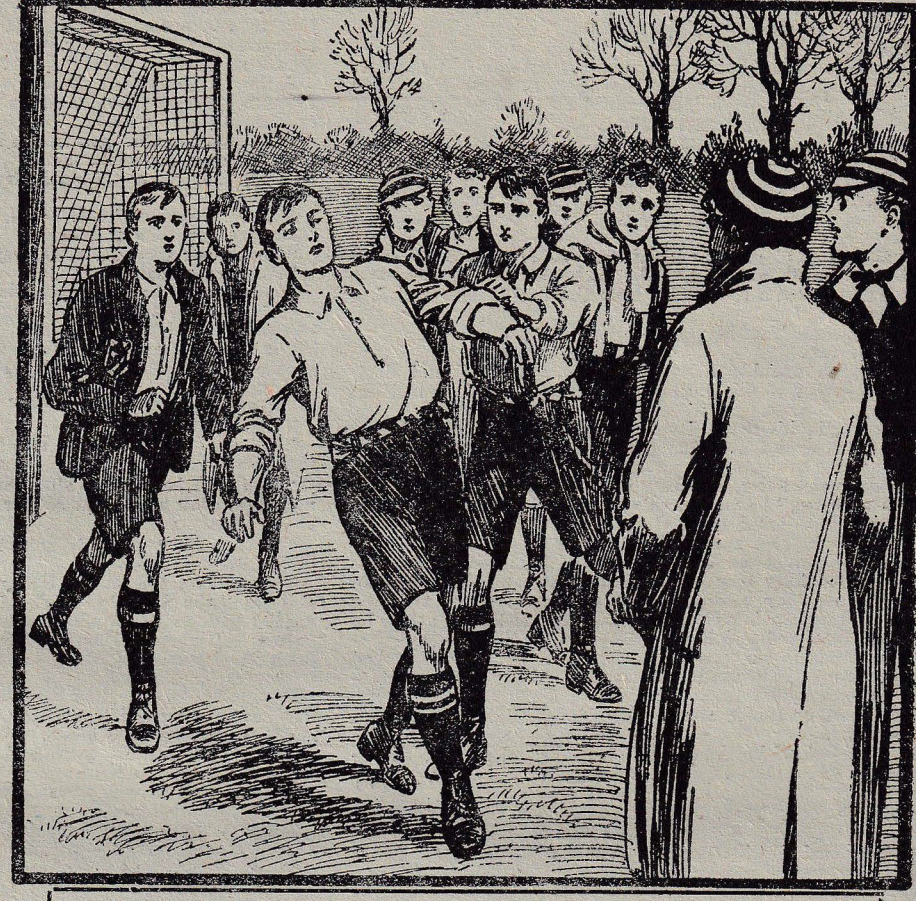
Kildare tore the envelope open and read the telegram. The next instant he stag-gered back, with a hoarse cry, "Mother!" Monteith eprang forward and supported the captain of St. Jim's.

Tom Merry cautiously. Kildare jumped. "Your claims!"