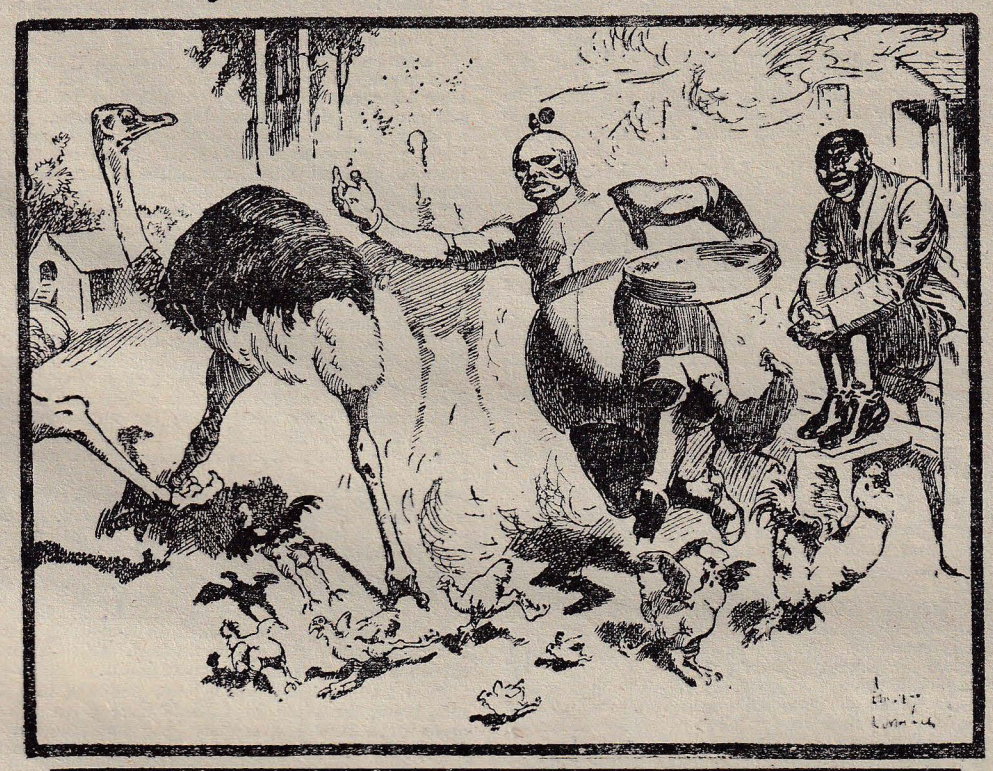
The steam man was amongst the ostriches before they knew what was happening, and was soon causing tremendous havoc. The ostriches fied for their lives, with the steam man in hot pursuit,