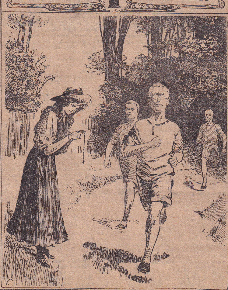
Next Saturday's two long, complete stories: "The Lyncroft Sports," a splendid tale of Spees the Ventriloquist & Co.; and "Grimsby Grit." the story of a North Sea fisherman's bravery. Please order your copy of "Pluck" in advance. Price One Penny.