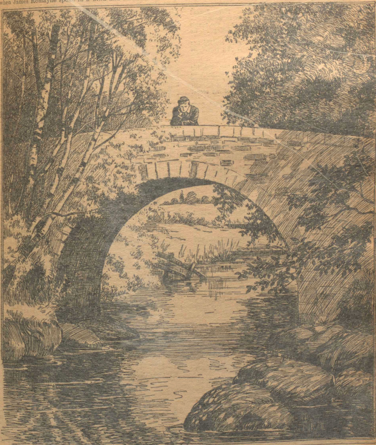
Kit folded his arms, and leaning upon the stone parapet gazed down into the pool from which he had rescued Railton the day he came to Northmoor. (See page 23.)

"Yes," he said heavily. "I'm going to do it. From this day I'm Kit Clavering, of Northmoor; Heaven help me!"