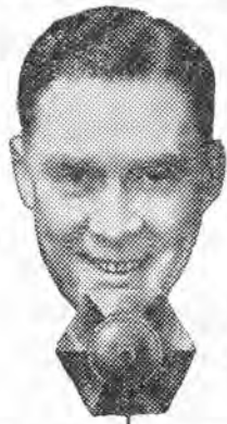
He's at it again, lads, and funnier than ever. Tune-in for another rib-tickling broadcast from this radio favourite.

In less than a minute a crowd was hunting in the quad for Cyrus—but less than a minute had been enough for the gangster! Cyrus was hitting the open spaces—in a dazed and dizzy state, with the biggest bump on his head that any gangster had ever collected.