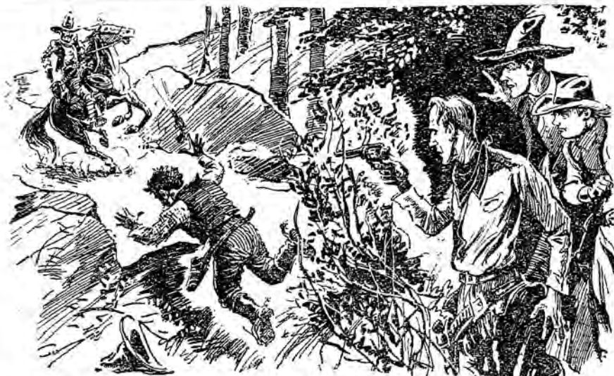
At the very moment that the hidden gunman prepared to shoot down the horseman he had ambushed, the roar of Kid's gun thundered behind him, and, with his weapon flying from his hand, the rustler rolled out of his hiding-place into the trail, yelling wildly.

The shadow of grim death was on him; but he was cool. He reckoned that he had a chance yet. Hardfist wanted him—but he wanted the Rojo cowboys still more! And Jad remembered the doc's paper in his belt.