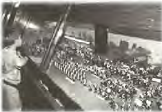
The Waterloo Museum

The Waterloo Museum in Crow Hill offers a wealth of history of the Napoleonic times, together with fascinating toy soldiers and memorabilia.