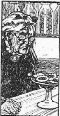
DAME TAGGLES (the old lady of the tuck shop)