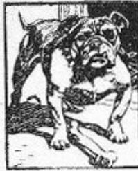
TOWSER (Herries' Dog)