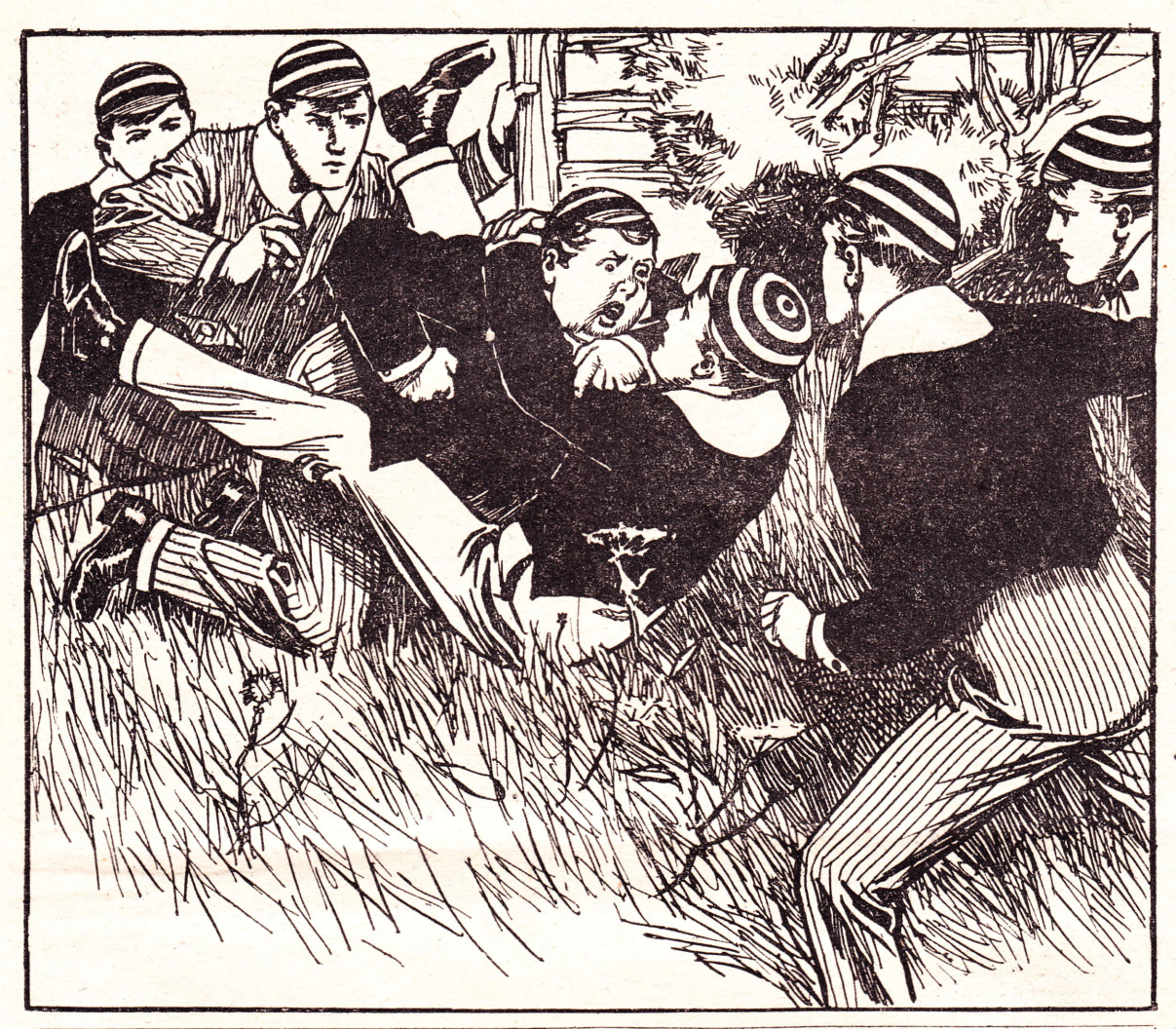
Harry Noble made a desperate grab at Fatty Wynn, and threw his arms round the fat junior's neck. thumped down. (See Chapter 11.)

The very decent letter from the new secretary put quite another complexion on the whole thing. Wayland Rovers were a very old club, and this attempt to persuade St. Jim's to play the match was plainly an effort on the part of the Wayland officials to regain their lost reputation as sportsmen.