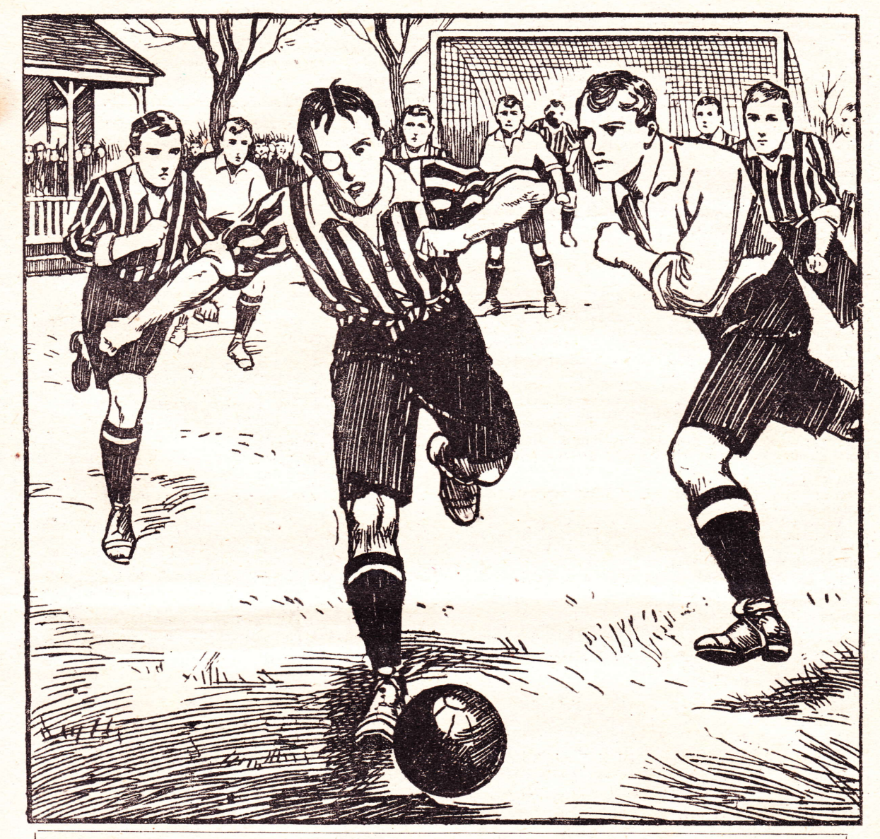
Arthur Augustus fastened on to the leather, and dribbled for goal. (See Chapter 7.)

"No doubt there is some charity or someone at Rylcombe who will be glad of the cash?"