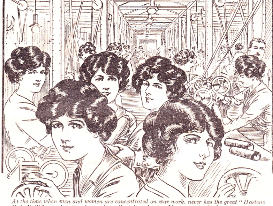
At the time when men and women are concentrated on war work, never has the great "Harlens Hair-Drill" exercise proved so universally triumphant. If you are in the least worried as to your hair health, send for this special four-fold gift offered you here without cost or obligation.

ls. and 23. 6d. per bottle, and "Cremex" Shampoo Powders 2d. each, or ls. per box of seven shampoos. Write to-day. Any or all of the preparations will be sent post free on receipt of price direct from Edwards' Harlene, Ltd., 20, 22, 24 & 26, Lamb's Conduit Street, London, W.C. Carriage extra on foreign orders. Cheques and P.O.'s should be crossed.