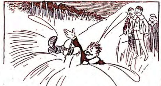
How Monkey Nuts ought to be photographed.

While passing a photographer's the other day, I was struck by the important pose adopted by some of the sitters. A few looked very concerned, while nearly all had an anxious look upon their faces that seemed to say: "I hope I come out better-looking than I really am, because if I don't, I shall go somewhere else next time. See!" Gazing wistfully at the works of art therein because I don't like to be seen walking along eating bananas, there was one of the specimens in the