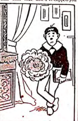
How Monkey Nuts is photographed.