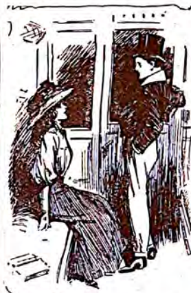
"As your eldah," resumed D'Arcy, "I should wegard it as my duty to look aftah you."

Tom Merry found corner-seats in a first-class carriage for Cousin Ethel and Miss Prynne, and they were safely disposed there, and the famous bag and umbrella were restored to the little governess.