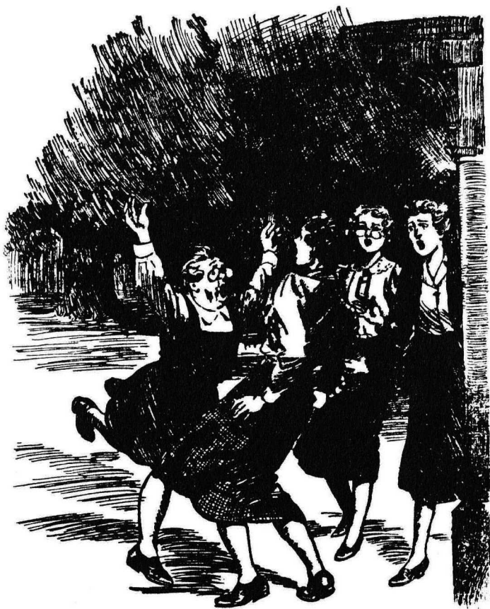
THE FATTEST FIGURE AT CLIFF HOUSE SCHOOL CRASHED INTO THE GAMES MISTRESS