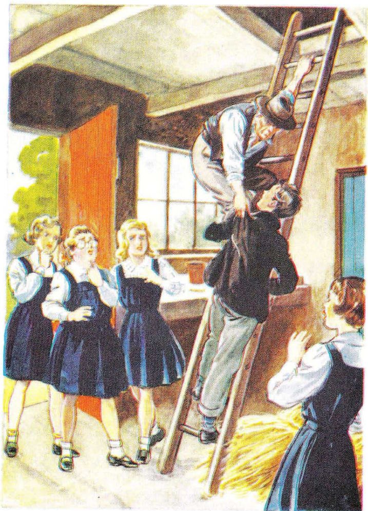
THEY DESCENDED INTO THE SHED, WHERE FOUR PAIRS OF EYES AND A PAIR OF SPECTACLES FASTENED ON THEM