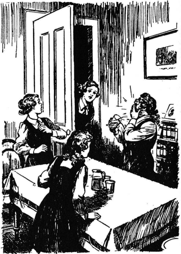
BESSIE SPLUTTERED AND CHOKED AND GURGLED