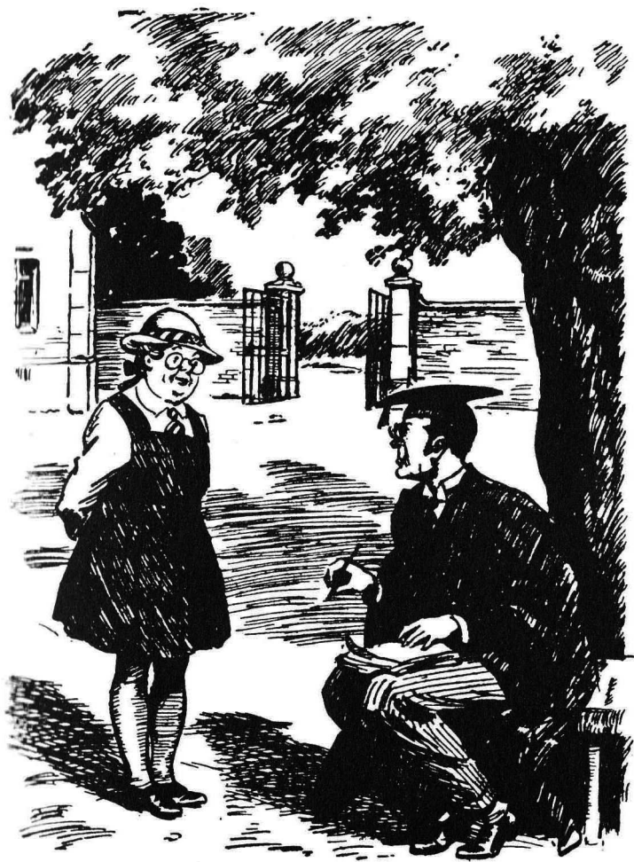
HE DID NOT SEEM PLEASED BY THE INTERRUPTION