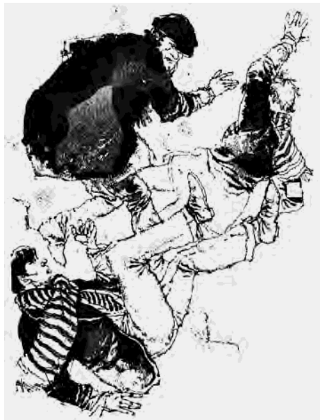
The man sprang neatly over them.

‘But if we’d left it open when we went out, there would have been plenty of time for it to pile up.’