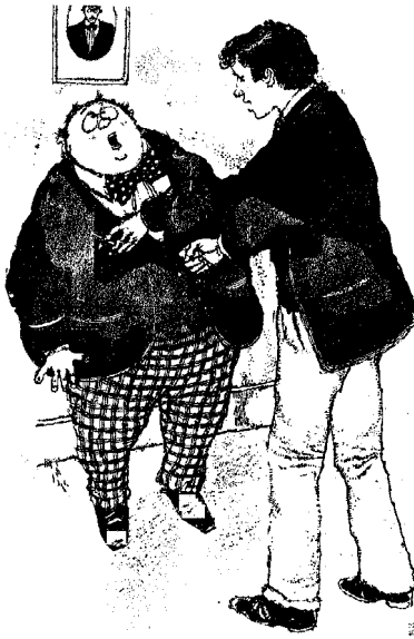
You're as crooked as a corkscrew!

The rest of the Famous Five looked astounded.