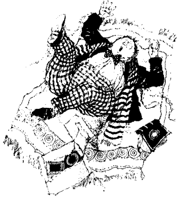
Bunter went on threshing about.

‘What’s that fat villain doing here?’ demanded Johnny. ‘It is him. It’s not his ghost, is it?’ asked Frank.