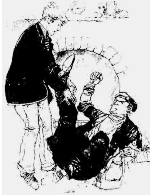
A body, covered in soot, crashed down into the grate, and then rolled on to the floor.

As Harry tugged again, there was the sound of something slithering and down came a leg.