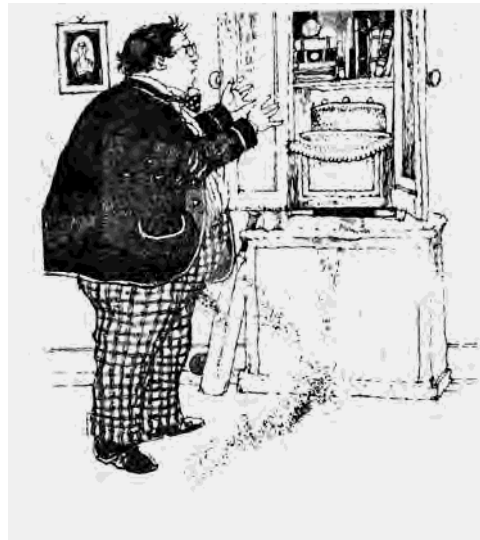
Bunter's podgy hands shot out.

'Oh, give it a miss, fatty! Heave yourself up, and get the cake out.'