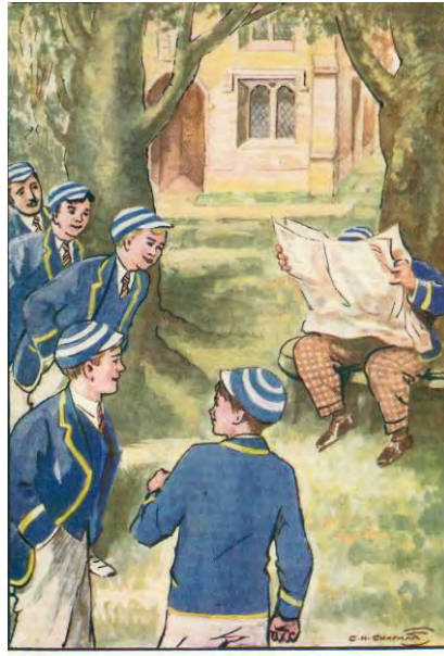
UNDER COVER OF THE NEWSPAPER, THE FAT OWL BREATHED HARD